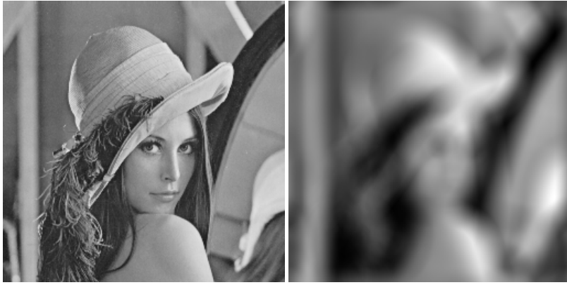
Fig. 1: Lena: original sharp image and the blurred one