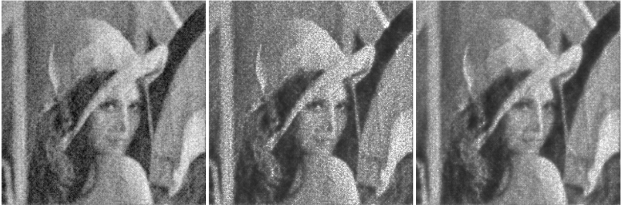
Fig. 2: Reconstructed images, Tikhonov method (left), and solutions of the moment problem, p = 1 , \lambda = 12 (middle), and p = b , \lambda = 0.11 (right).