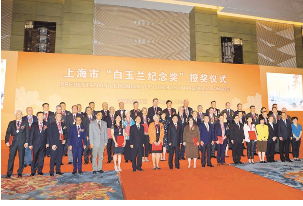
Magnolia silver award recipients pictured in Shanghai yesterday. Fifty expats were honored for their contribution to the city's development.

FIFTY people from 19 countries were given the Magnolia Silver Award yesterday in recognition of their contribution to Shanghai's development.